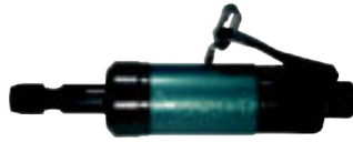
RG-383-06 (6mm collet chuck) RG-383-20 (1/4" collet chuck)