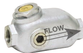
Model 0-R Lubricator with optional pressure release cap